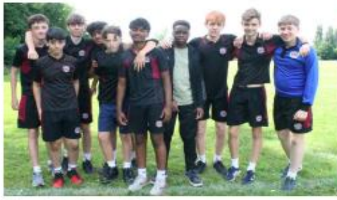
Year 10 Rounders