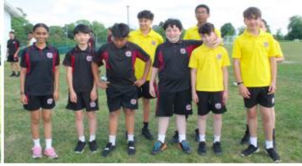
Year 8 Rounder