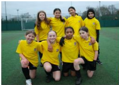
Year 7 Girls Football