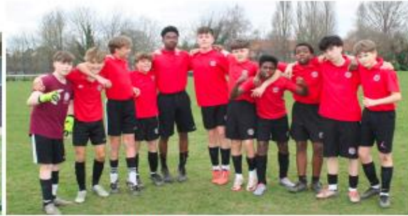
Year 9 Football