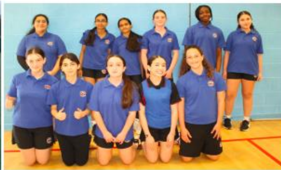
Year 8 Girls Basketball