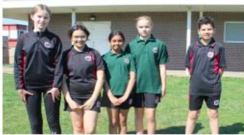
Year 7 Rounders