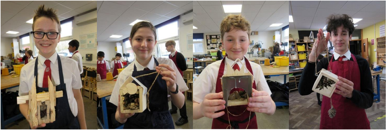
Some wonderful Bug Houses made by our Year 8's who have been looking at Sustainability and Environmental issues