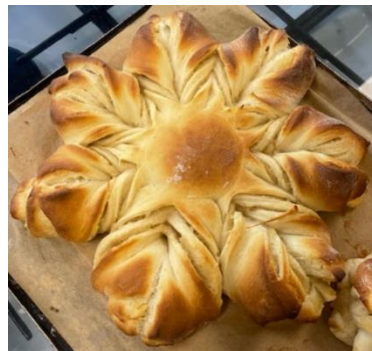
Year 9 Chocolate stars