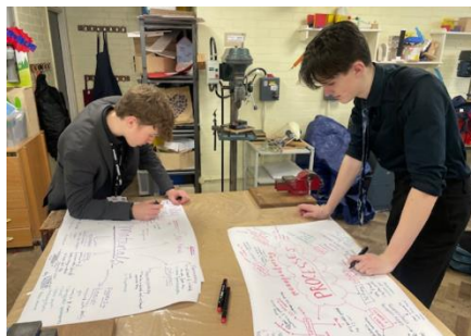
Year 12 Revision session