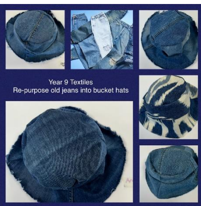
Year 9 Textiles Re-purpose old jeans into bucket hats