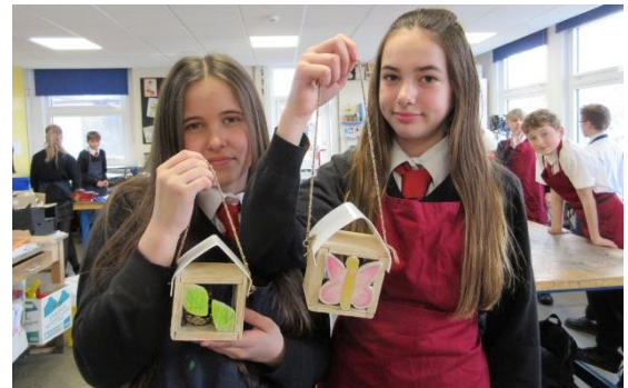
And our Year 11's have been working so hard on their GCSE coursework creating the most amazing solutions to the Contextual Challenges set for them