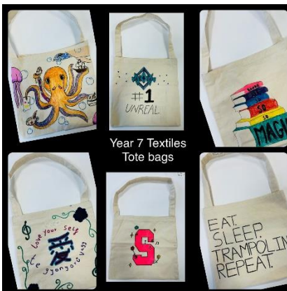
Year 7 Textiles Tote bags