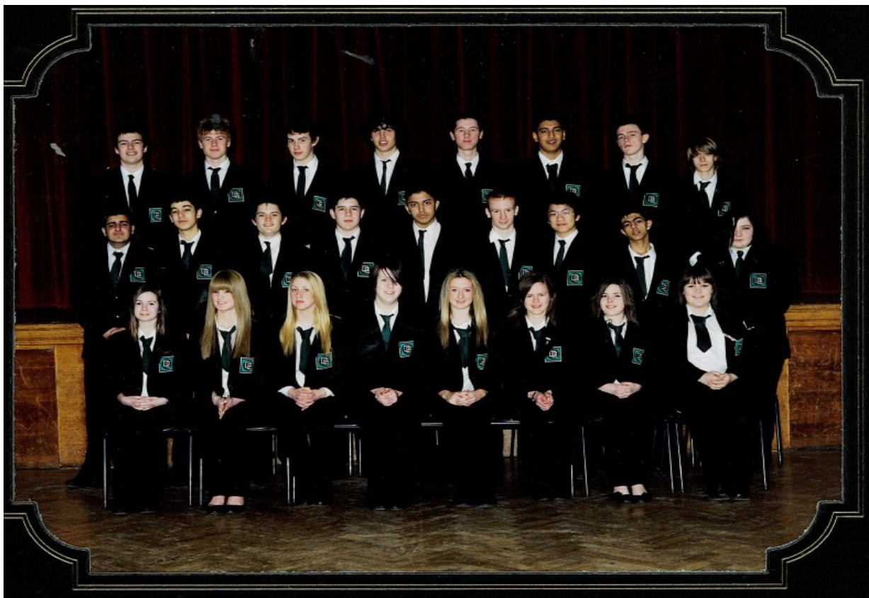
11 FD 2000