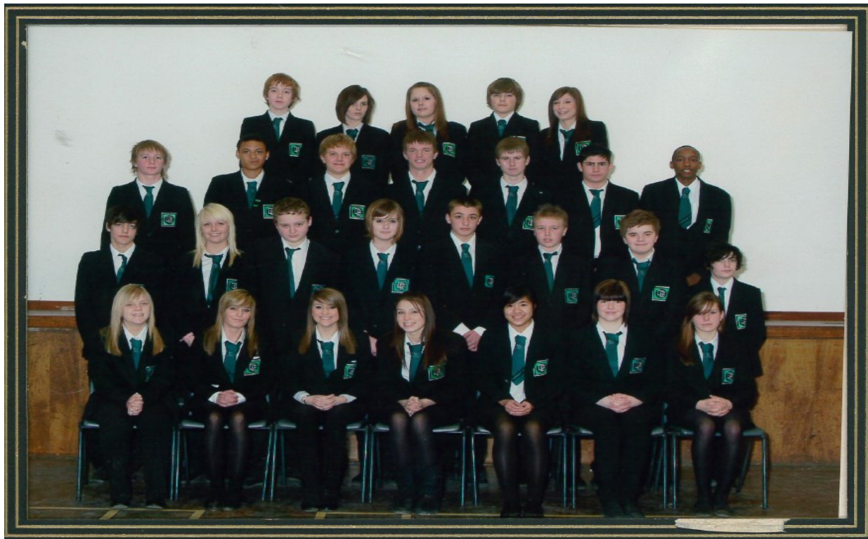
11 FD 2008